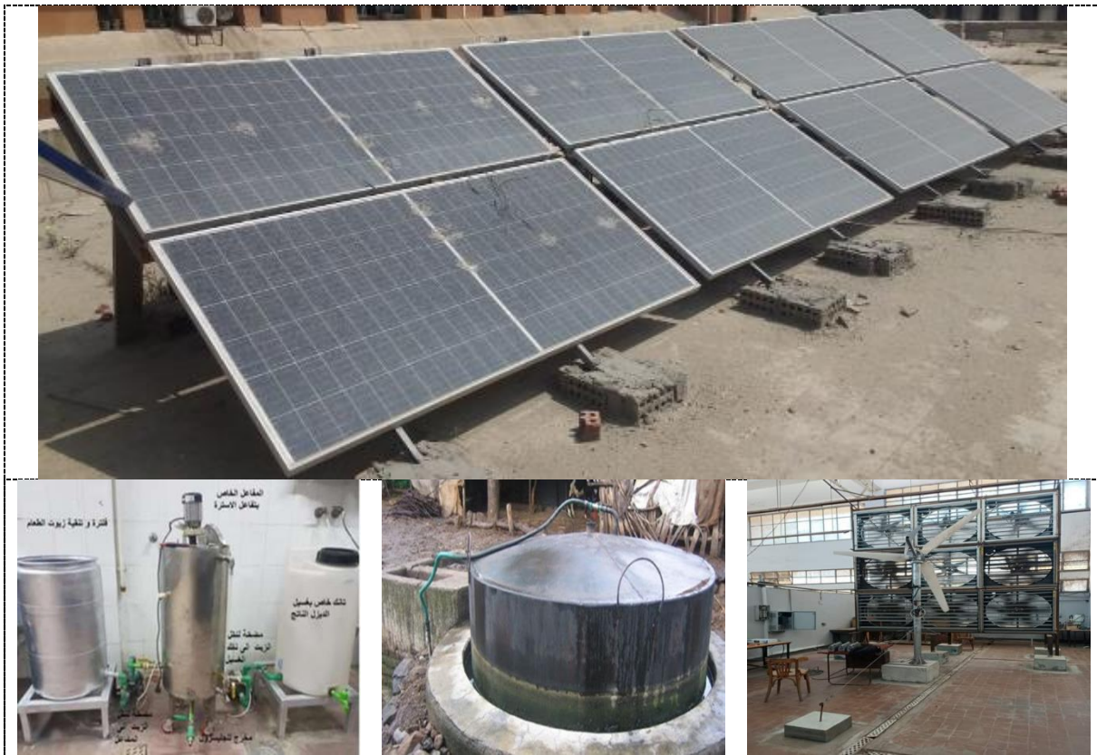
Figure 2. Renewable energy sources of Benha University (solar power, Biodiesel, clean biomass and wind power).