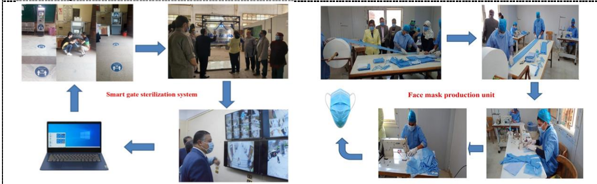
Figure 3. Innovative programs during COVID-19 pandemic of Benha University (smart gate sterilization system and face mask production unit).